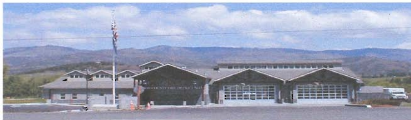
Headquarters Station in Phoenix, Oregon