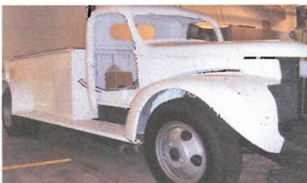
The same truck as of January 2008

The truck is currently at our Headquarters Station One in Phoenix. We welcome visitors, and invite you to stop in and take a look at history coming alive! Call Brian Bolstad at 535-4222 for more information.