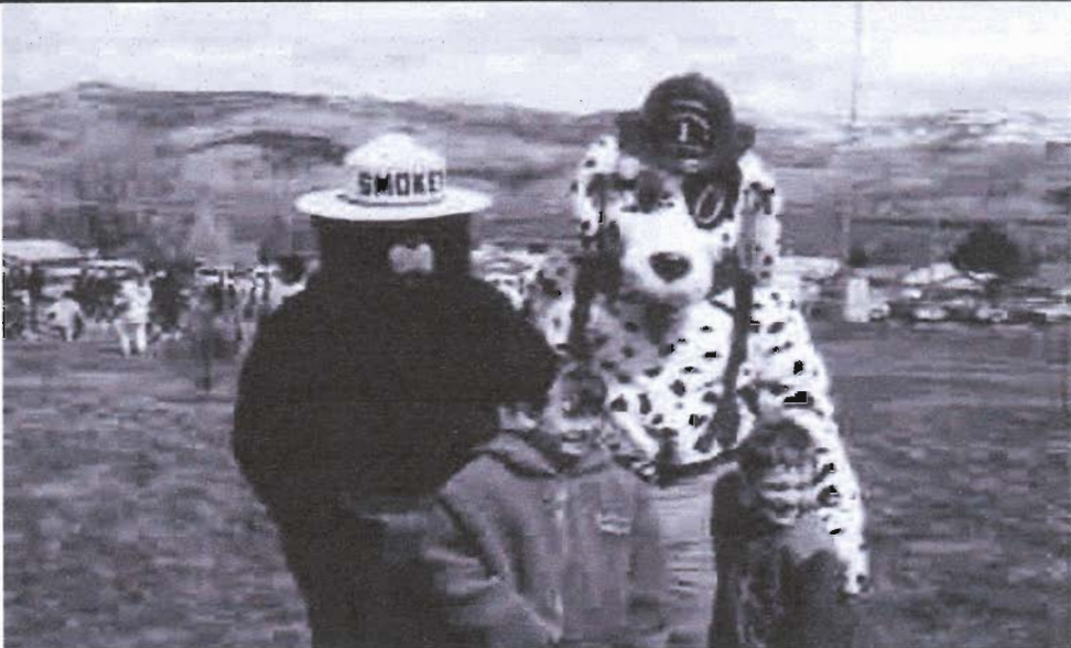
Smokey Bear and Sparky the Dog visit children during the 1st Annual Easter Egg Hunt sponsored by Fire District 5 at Chuck Roberts Park.

Fire District 5 is actively working with local emergency managers to provide emergency preparedness information including booklets, family disaster kits and a step-by-step action plan that families can use to prepare for disasters of all types. The "Jackson County Emergency Plan For Families" publication is available now at both fire stations. This guide is free to anyone who wants one, so please stop by to pick one up.